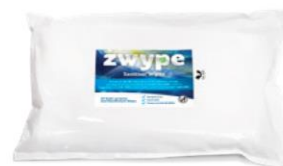
ZWYPE Sanitiser Wipes