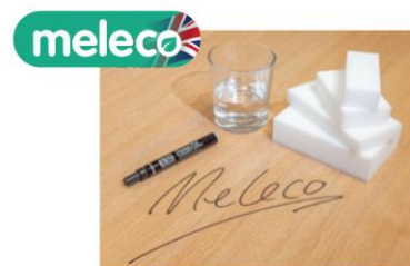
Meleco An Environment-Friendly Eraser Sponge